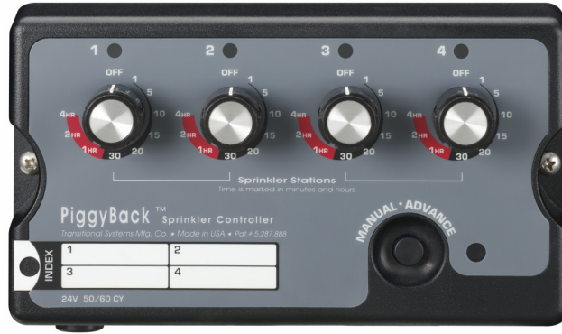
UNIVERSAL 4 STATION MODULE